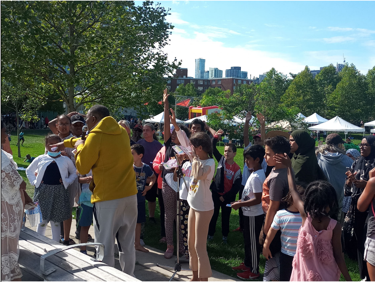
(Sunday in The Park - annual Summer event)

The following is a list of the major accomplishments of the Community Building Working Group for the period beginning January 1, 2020 to December 31, 2023.