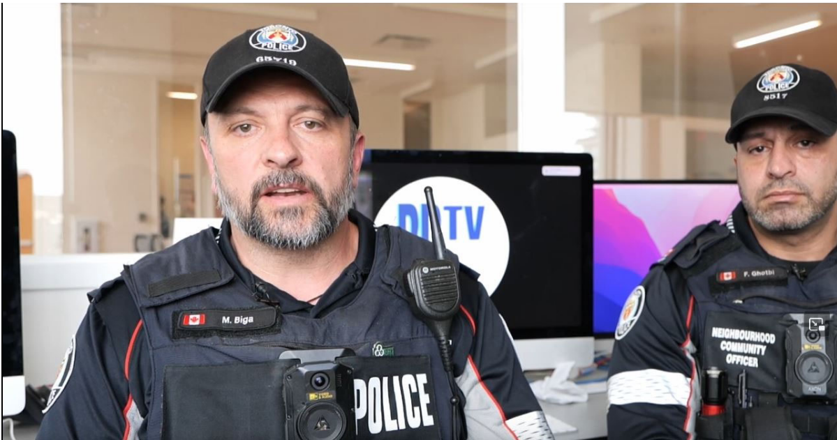
(Community Police Officers with RPTV)